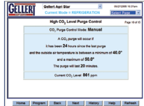
CO 2 Purge Control