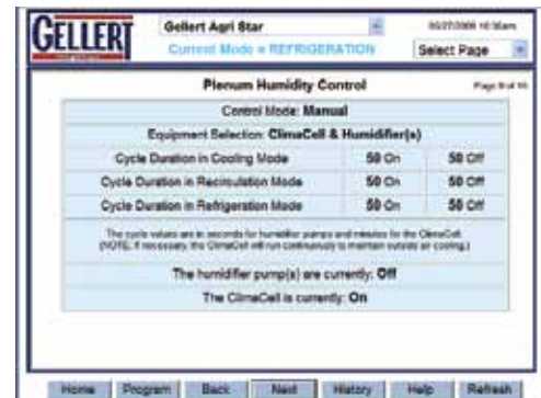
Plenum Humidity Control

The Gellert Company is a name synonymous with quality equipment and innovative design for raw product storage systems. Since 1964, The Gellert Company has provided the most advanced Ventilation, Humidification, Refrigeration and Control equipment with an emphasis on efficiency, economy, dependability and fully Certified system performance. The Gellert Company is the industry leader in sales and service of agricultural climate control systems and continues to be first in balanced system design, first in equipment quality, and first in system performance. From potatoes, to onions, to grain, and everything in between... think Gellert.